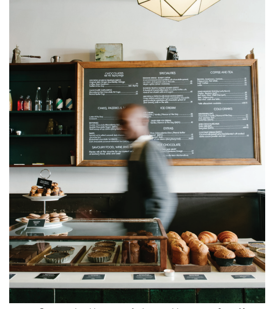
Conceptual image of planned taproom & café in Barefoot Village.

Barefoot is located between Denver and Fort Collins, both about 35 miles in either direction. Which means you have entertainment, foodie destinations, culture and college-town charm all just a short drive away. Plus, Longmont is just 10 miles away, to enlarge your