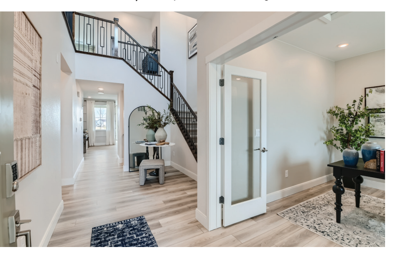
Brookfield Residential Artisan Four model elegant entryway.

If you want to learn more about Barefoot, and be the first to know about Barefoot Village's grand opening this summer, go to barefootcolorado.com and join the interest list. The community will keep you updated on news, progress and special events.