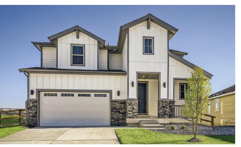
A variety of architectural styles are available at Barefoot. (Photo: American Legend Homes V434 home plan)