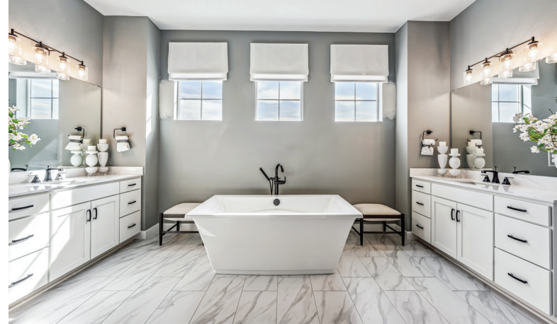
Richmond American Homes' Pinecrest model primary bath suite.